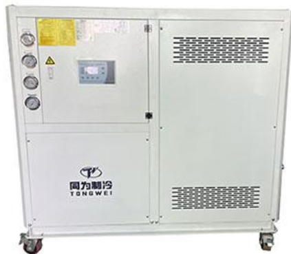
Water-cooled Beverage Process Scroll Chiller