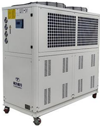
Air-cooled Beverage Process Scroll Chiller