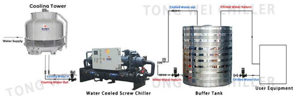
Water-cooled Beverage Process Chiller Installation Drawing

Should you choose an air-cooled or water-cooled Beverage Process chiller? Contact Us for help determining the best solution for you.