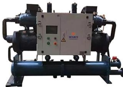
Water-cooled Beverage Process Screw Chiller