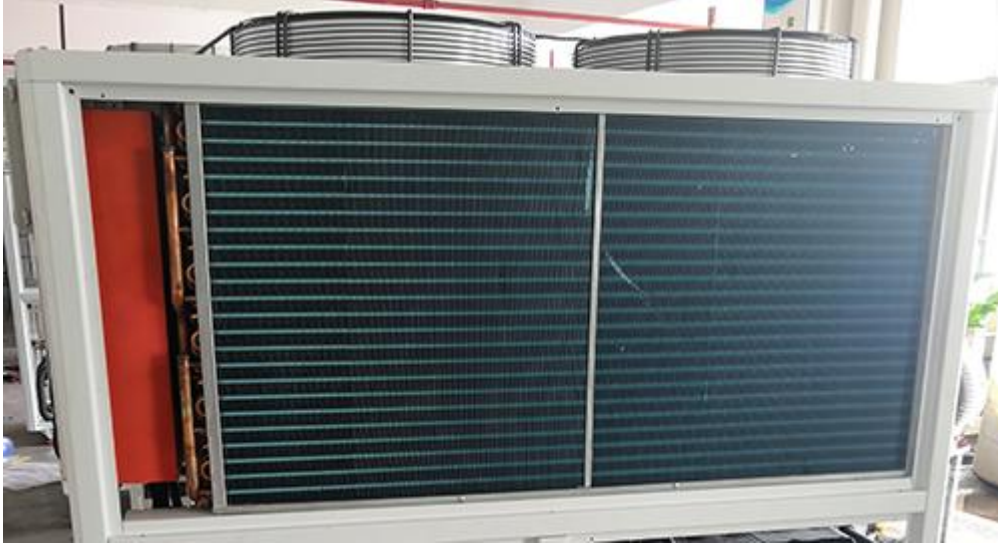
Aluminum fin+fan Condenser for air-cooled brewery chiller

The condenser for air-cooled Beverage Process chiller is equipped with efficient cross-seam fins and female threaded copper tubes for high heat exchange efficiency and good stability. Its function is to cool down the refrigerant steam released from the compressor into a liquid or gas-liquid mixture.