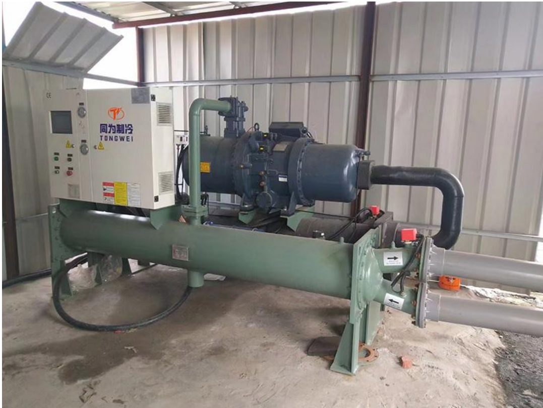
60 Ton Water Cooled Screw Beverage Process Chiller

A Beverage process chiller is a specialized cooling machine designed to cool or chill beverages during various stages of production or storage. It's an essential component in industries like beverage manufacturing, where precise temperature control is crucial for quality and safety.