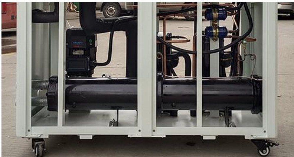
Shell and tube Condenser for water-cooled brewery chiller

The condenser for water-cooled Beverage Process chiller is shell and tube, with the internal copper tubes employing an outer thread embossing process. This design effectively enhances the heat exchange efficiency between the refrigerant and water during the process. Compared to traditional smooth copper tubes, the outer thread embossing process increases the surface area of the copper tubes, thereby expanding the contact area for heat exchange and improving the thermal conductivity of the condenser. This optimization design allows the condenser of the water-cooled chiller to transfer heat from the refrigerant to the water more rapidly and consistently, enabling the water to carry away the heat.