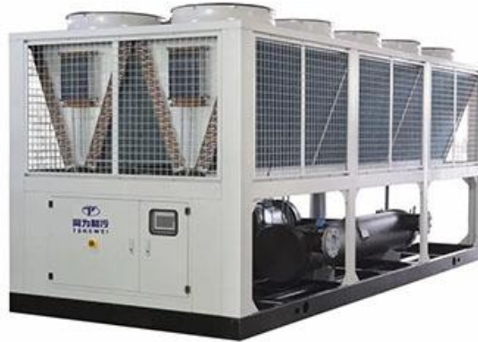
Air-cooled Beverage Process ScrewChiller