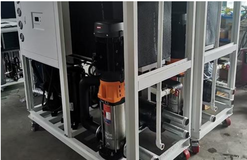
High Pressure Water Pump