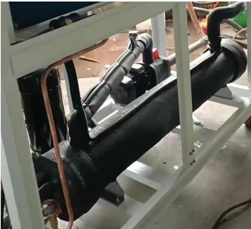
Shell and Tube Evaporator