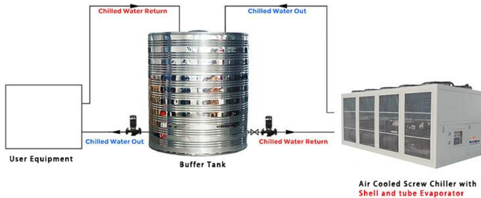
Air-cooled Beverage Process Chiller Installation Drawing

Water-cooled Beverage Process chillers use water from an external water cooling tower to dissipate heat from the brewing processes. These systems are longer lifespan, Relatively quiet, and more consistent cooling performance than the air-cooled Beverage Process chiller.